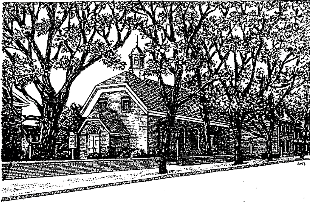
New Castle Presbyterian Church ~ Built 1707 ~ New Castle, Delaware