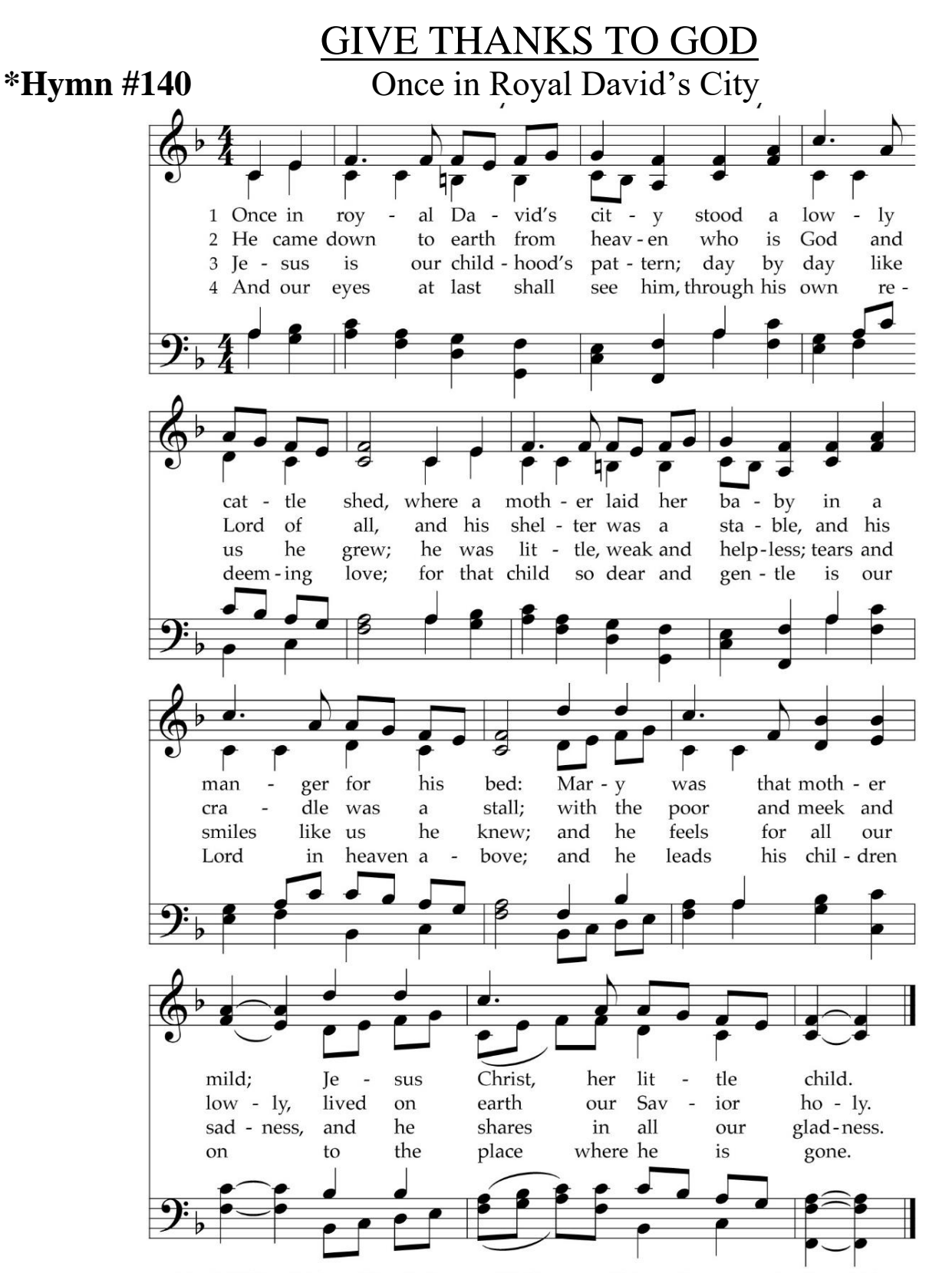
Like "All Things Bright and Beautiful" (see no. 20), this popular Christmas hymn was written by an Irish poet to illustrate for children the various articles of the Apostles' Creed. It is not known which of several English villages the composer had in mind when naming this tune.