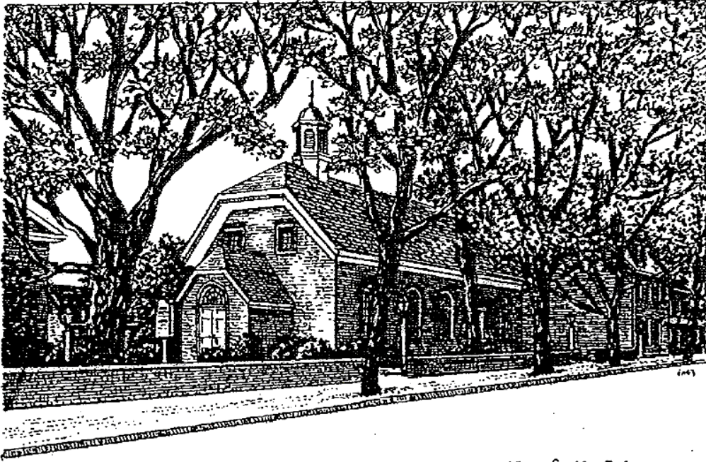
New Castle Presbyterian Church ~ Built 1707 ~ New Castle, Delaware