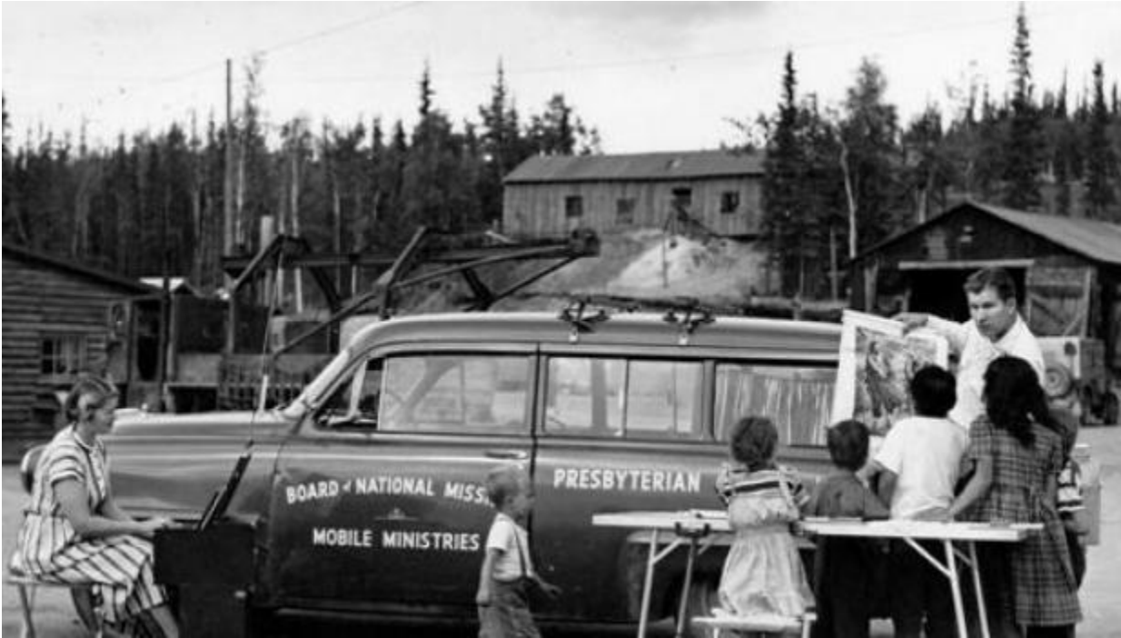
A minister holds a Sunday school class outdoors.

September 20, 2014 1:30 pm to 5:00 pm Old Pine Presbyterian Church