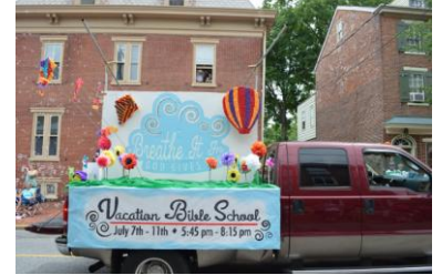
LAST YEAR'S FLOAT

Parade kicks off from Chestnut Street at 11:00 am.